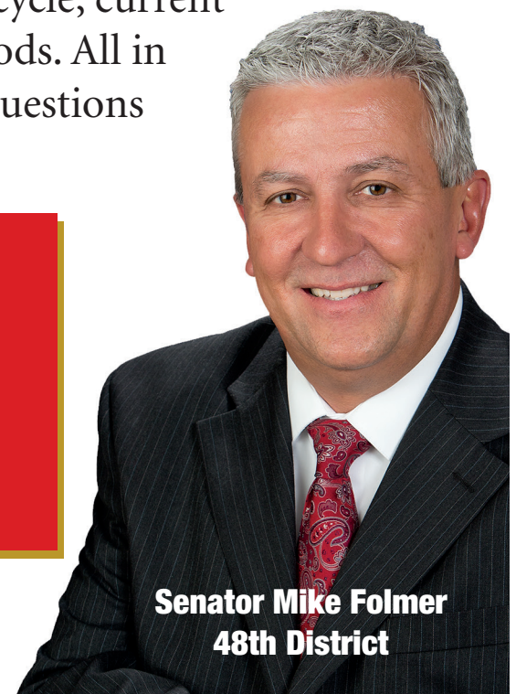
Senator Mike Folmer 48th District

For more information, please contact Senator Folmer's Office at 717-787-5708.